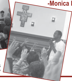
This is part of an occasional series called "Music Stirs the Soul."